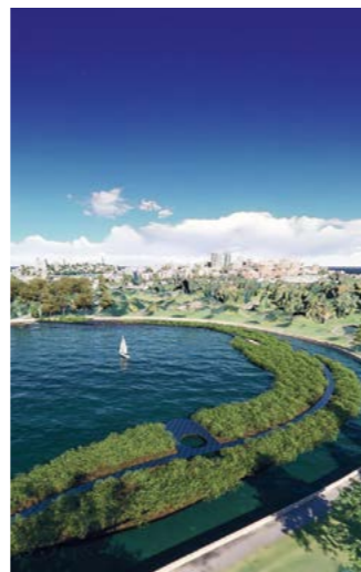
Artist's impression of the proposed floating mangrove pontoon walkway alongside the Royal Botanic Garden Sydney.

The test deployments of the MICI pontoons have sparked wider interest in Australia. A proposed memorandum of understanding between Project Halo and the Royal Botanic Garden Sydney could see a large floating mangrove walkway linking the Sydney Opera House and the museum district via the Botanic Garden – a landmark example of nature-based adaptation that tackles sea-level rise and seawall failure in Sydney's world-famous harbour. The concept has already received strong support from the Sydney Harbour Roundtable, which includes government representatives responsible for approvals and funding. This exciting proposal has the potential to continue Project Halo's vision beyond its current timeline.